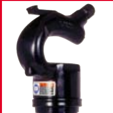
Pistol grip handle