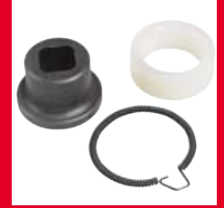
Lower sleeve, Polyurethane bumper and standard retainer spring