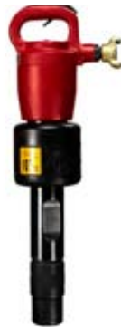
FL 0022 SVR