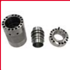
Special Boyer valve