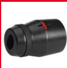
Quick change retainer