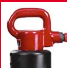
FL 0022/FL 0025 handle